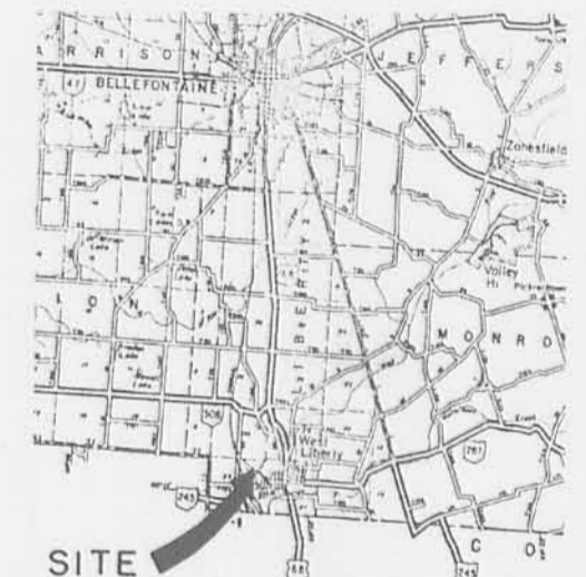
VICINITY MAP SCALE OF MILES

KARL Z. & REBECCA L. SMITH D.B. 362, PG. 889 ORIGINAL SURVEY AREA = 41.68 Ac. (See Map Index No. 5857)