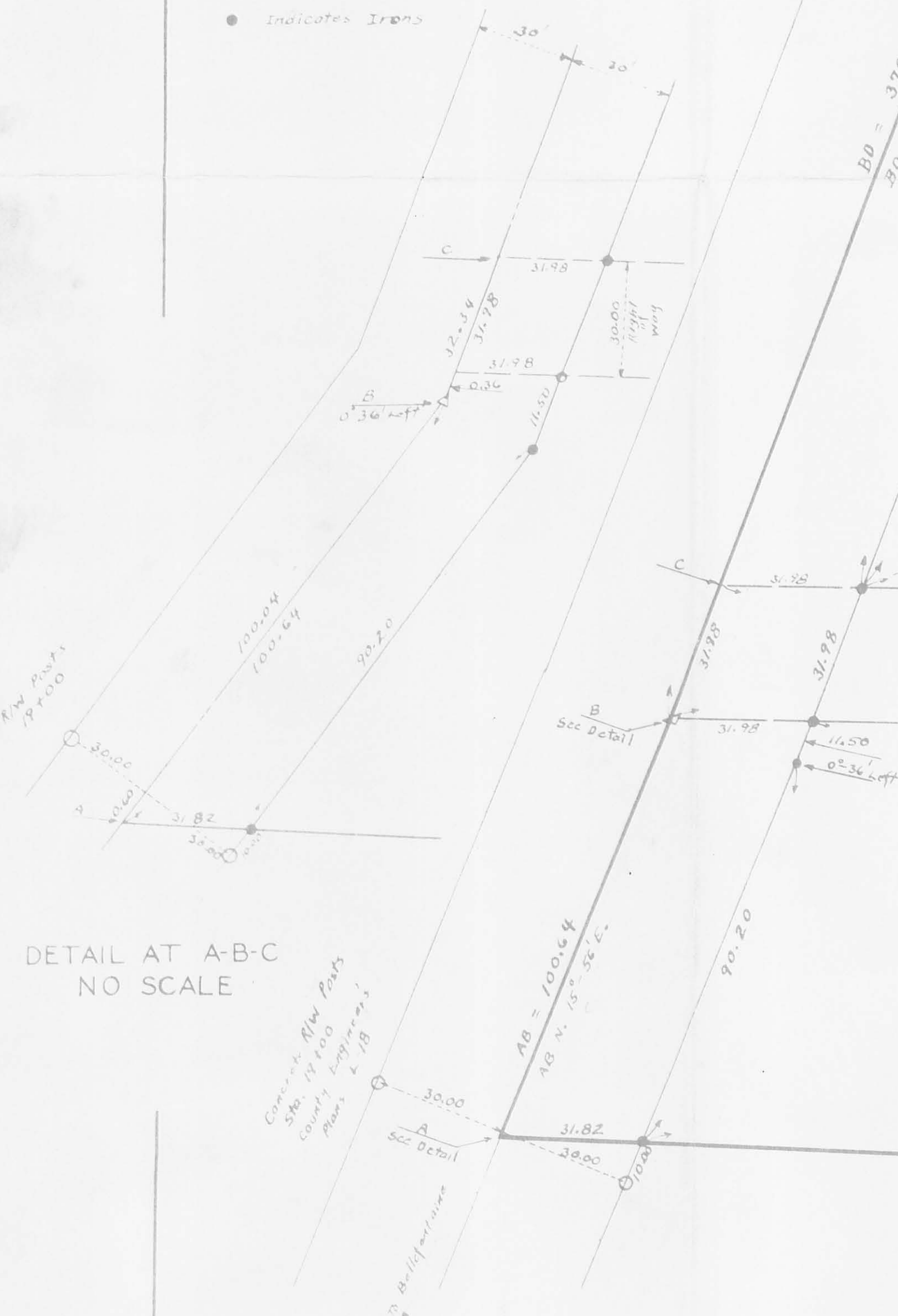
DETAIL AT A-B-C NO SCALE

Note:- Telephone line about one foot north of line AB. Poles not shown.