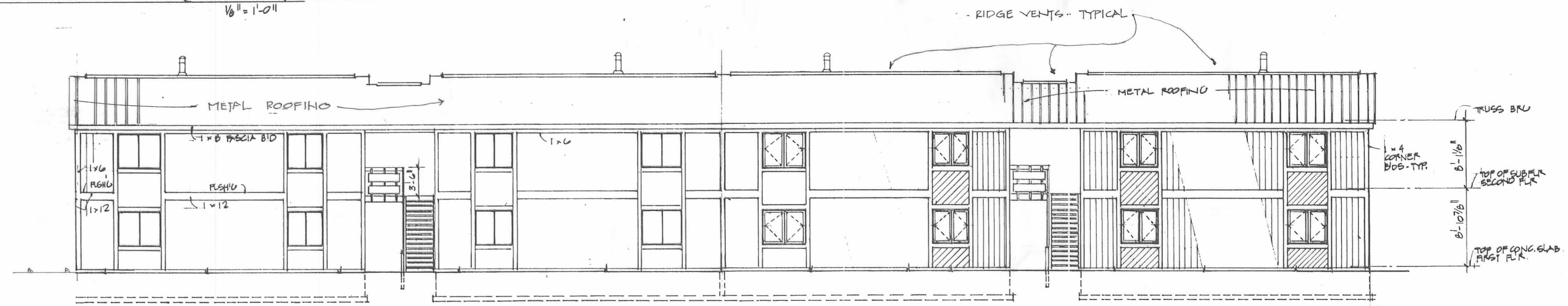
PARKING SIDE ELEVATION (REAR) 1/8" = 1'-0"